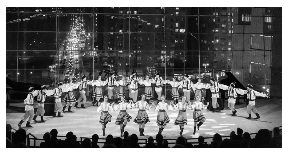
We pay tribute this year to the dancers of Ukraine and honor the Voloshky Ukrainian Dance Ensemble for their valued artistry and long-time collaboration with Booking Dance Festival NYC.

Our company has been showcasing at APAP for more than 30 years and I must say that this was the most pleasant and civilized showcase event. Your staff and volunteers were wonderful and the tech crew was very nice to work with. I especially appreciate how your programming and ambiance brings an artful touch to an evening performance... rather than showcases that can feel like cold business transactions.