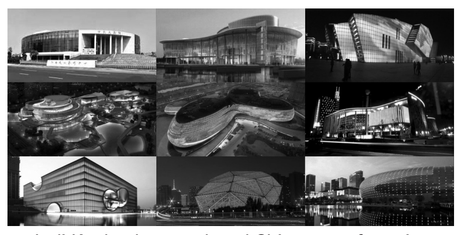
Jodi Kaplan has produced China tours featuring more than 150 performances in 47 cities!

The agency is proud to announce a new partnership with HUMANHOOD, an exciting deep dive venture into the expansion of dance beyond. Experiencing the next level of movement on and off the stage.